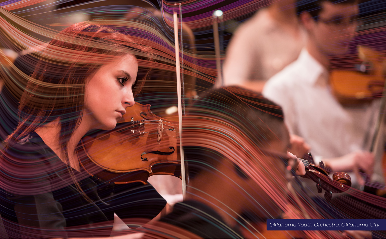
Oklahoma Youth Orchestra, Oklahoma City